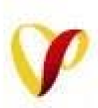
Thrivent Financial for Lutherans

For many years, Beta Sigma Psi has been working diligently to foster a relationship with Thrivent and its predecessors AAL and Lutheran Brotherhood. It is a great sign that we will be receiving additional support over the