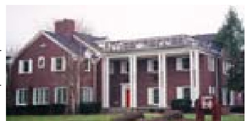
Beta Chapter House

The weekend will conclude on Sunday morning with church at University Lutheran.