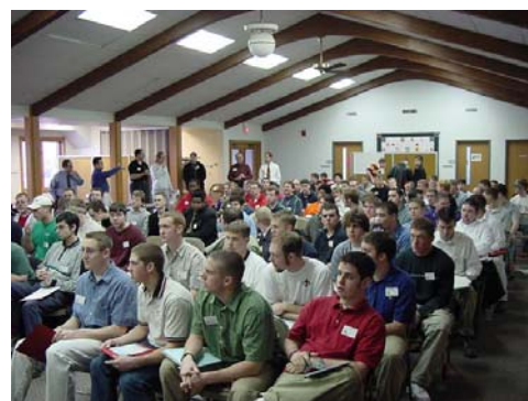
Beta Sigs at 2001 MEF in Columbia, MO

In addition to this topics, the National Fraternity is sponsoring a seminar for Alumni Chapter Officers which will focus on ways to build better communication among our members,