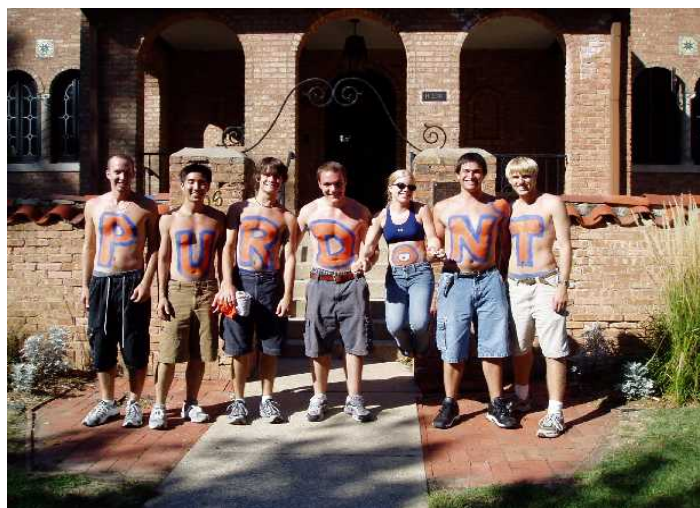
Alpha Men in front of the Chapter House Before the Illinois-Purdue Football game

The guys have also developed a growing fan base. They have twice appeared in the student newspaper, the Daily Illini, and once in the local newspaper, the Champaign Gazette. Additionally, numerous other photographers stop by for great shots. The most interesting game so far has been UCLA, the second game. Numerous UCLA fans wanted their picture taken with the guys. And one of the proudest moments for the Beta Sigs was posing