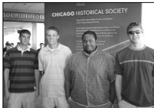
Delta colony and Alpha-Alfa chapter members pose for a photograph in Chicago during the 2004 national convention in August.

Through the efforts from many individuals, we now have 11 young men who have signed on to become Beta Sigs in the next few years. This meets the National guidelines of 10 members for colonization. It has been a slow but steady process with three signed last fall, five more this spring, two over the summer and two the first week of classes. Unfortunately, one was forced to drop out due to bad grades.