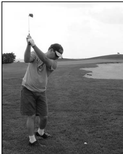
A Beta Sig tees off at the second annual Delta Golf Outing. The event included alumni, colony members, and one recruit.

In short, the second annual Delta Chapter golf outing was a success with hopes it will be even bigger next year. Plans are to host this again the day of the first night football game next year and is open to all Beta Sigma Psi alumni and to our new members and recruits.