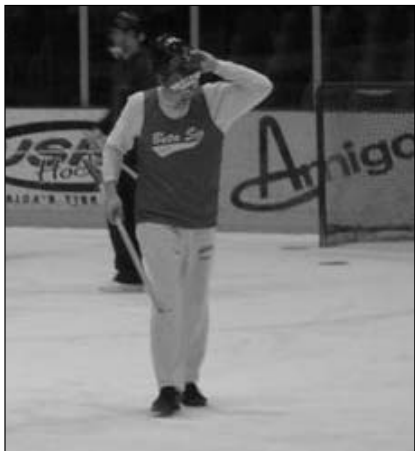
A Delta Colony member takes a break after a rough game of "broomball" in an intramural match with another fraternity.