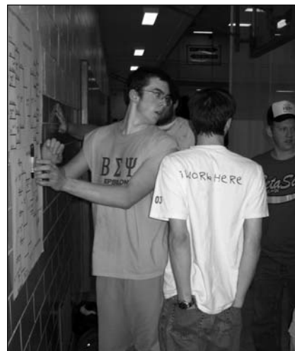
Beta Sigs analyze the players' bracket at the national basketball tournament held in West Laffayette, Ind., at Purdue University.

Zeta chapter has remained a consistent force recently making it to the final