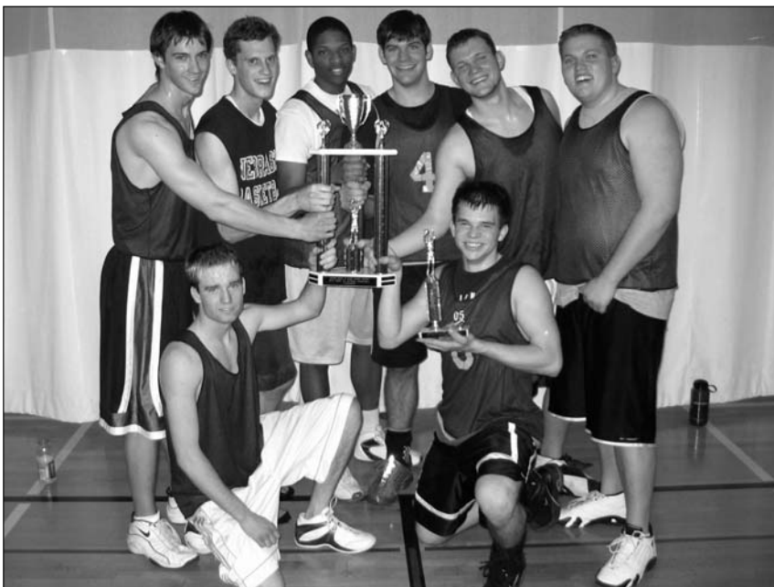
The Alpha-Alpha Chapter team from Midland Lutheran College proudly display their newly won trophy after defeating the Delta Alumni team in the final round of the tourney.